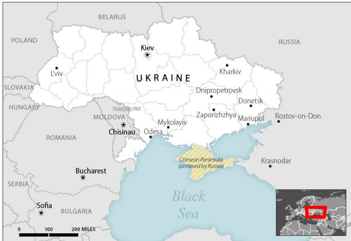
Figure 1. Ukraine