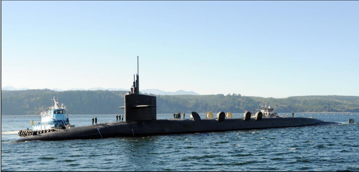
Figure 1. Ohio (SSBN-726) Class SSBN With the hatches to some of its SLBM launch tubes open