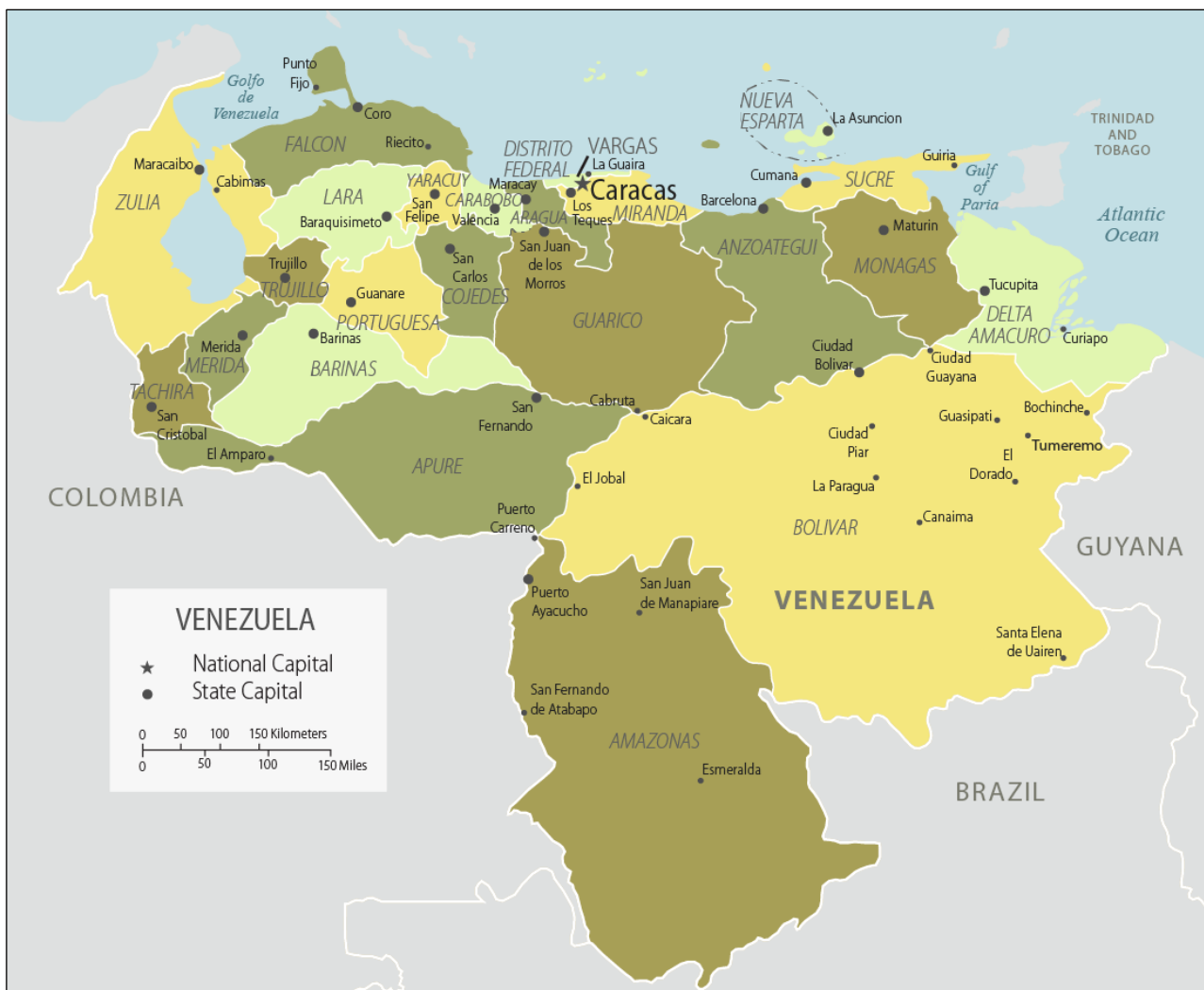
Figure 1. Map of Venezuela