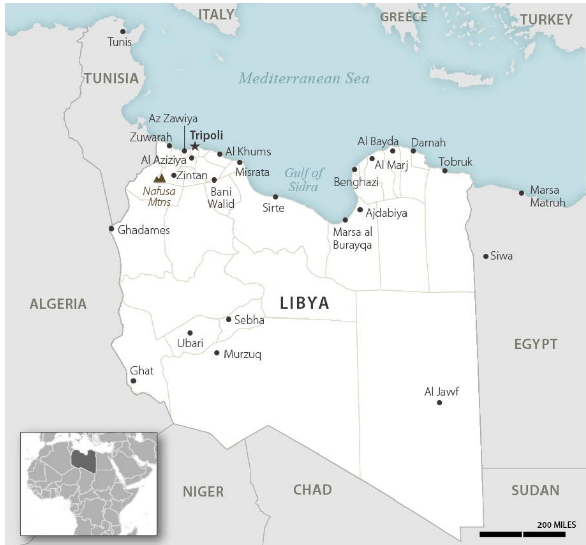
Table I. Libya Map and Facts

Land Area: 1.76 million sq. km. (slightly larger than Alaska); Boundaries: 4,348 km (~40% more than U.S.-Mexico border); Coastline: 1,770 km (more than 30% longer than California coast)