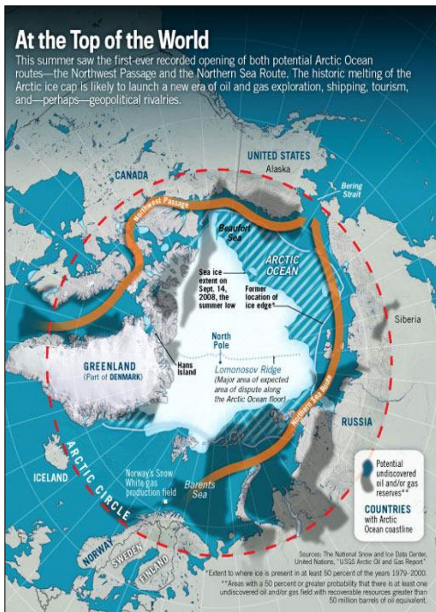
Figure 3. Arctic Sea Ice Extent in September 2008, Compared with Prospective Shipping Routes and Oil and Gas Resources