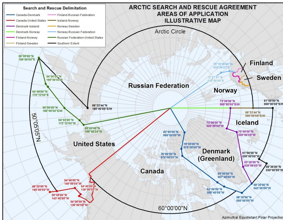
Figure 4. Illustrative Map of Arctic SAR Areas in Arctic SAR Agreement (Based on geographic coordinates listed in the agreement)

Source: “Arctic Search and Rescue Agreement,” accessed July 7, 2011, at http://www.arcticportal.org/features/features-of-2011/arctic-search-and-rescue-agreement .