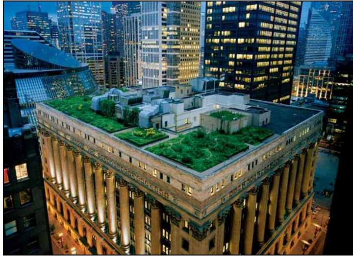
Figure A-1. Green Roof in Chicago