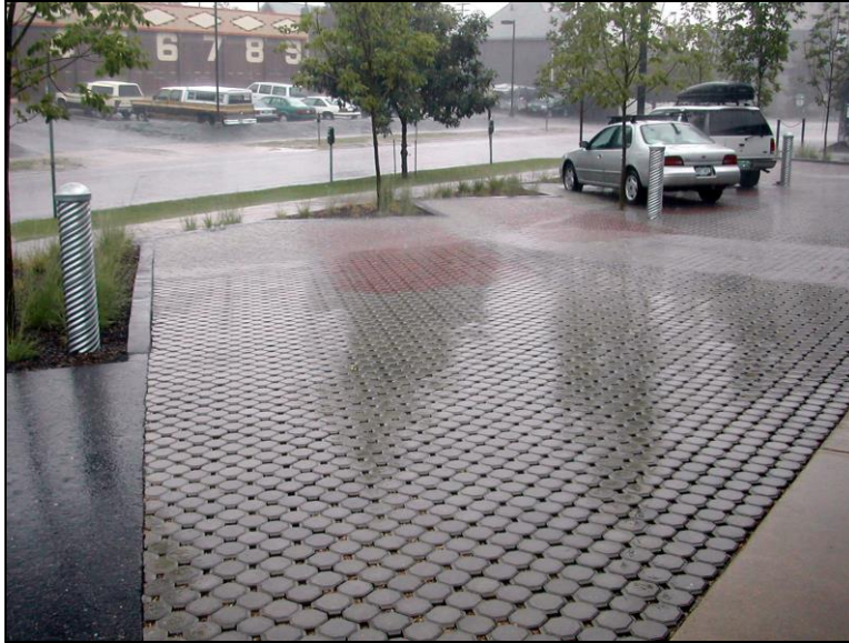
Figure A-5. Permeable Pavement