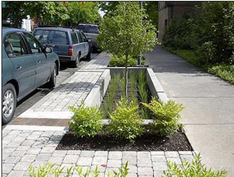
Figure A-4. Infiltration Planter