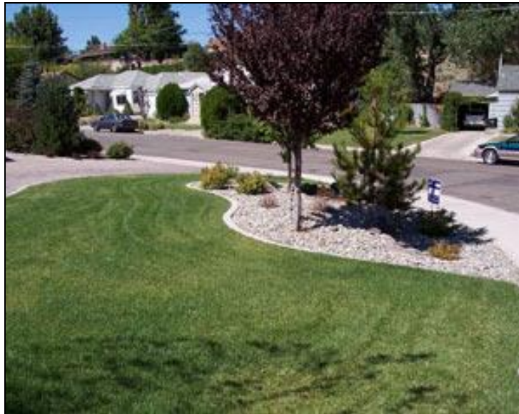
Figure A-2. Rain Garden