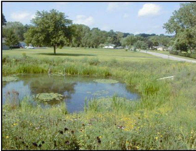
Figure A-6. Constructed Wetland for Stormwater Management