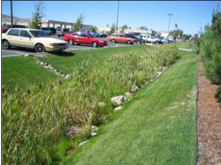
Figure A-3. Vegetated Swale