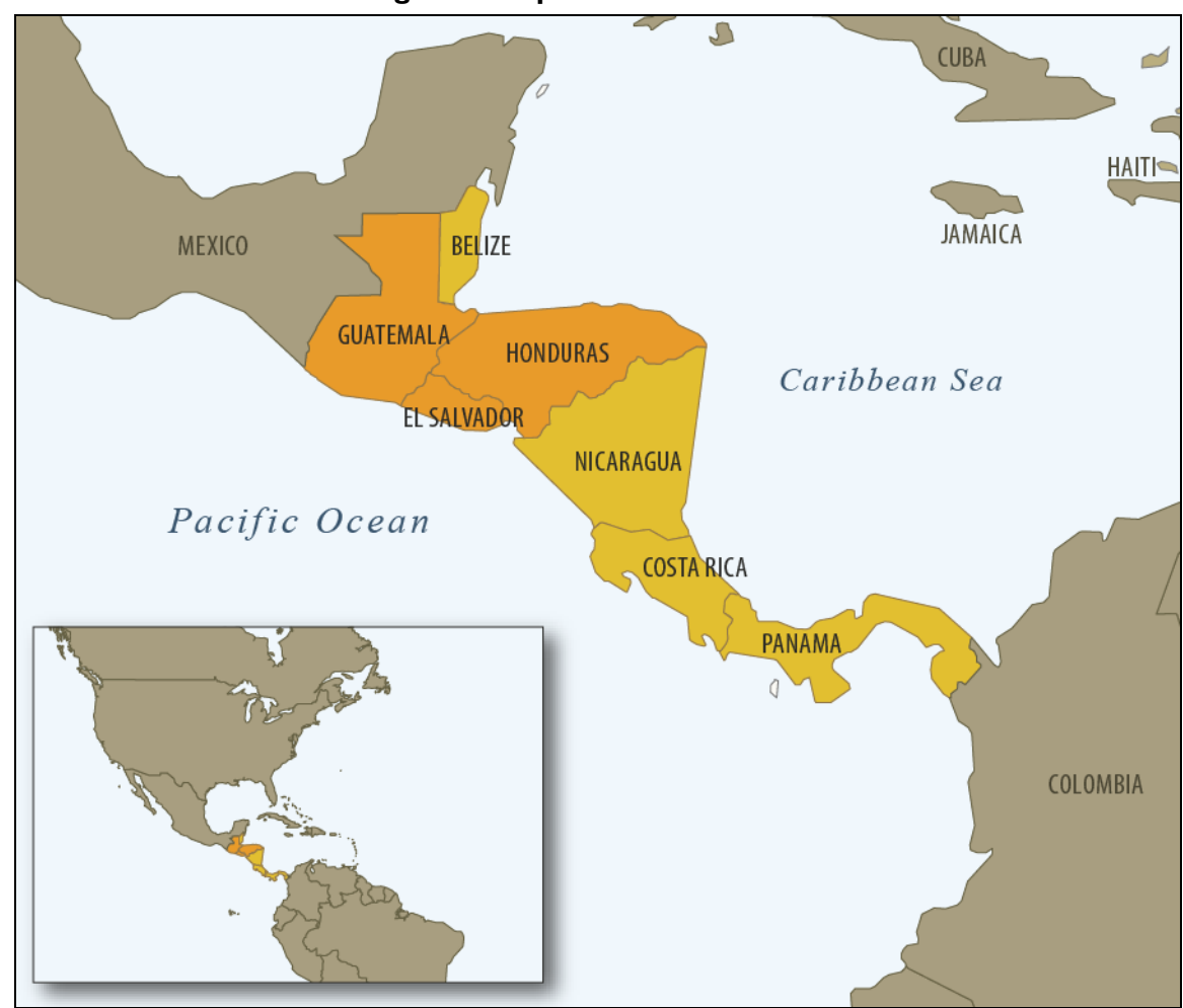
Figure 2. Map of Central America

for most of the human rights abuses committed. Many Central Americans fled the region and sought refuge in the United States. The vast majority of Salvadorans and Guatemalans were denied asylum, however, since the U.S. government insisted that its allies in the region were not responsible for human rights violations. During this time period, the United States also established the Caribbean Basin Initiative (CBI; formally the Caribbean Basin Economic Recovery Act—P.L. 98-67) to support political and economic stability in Central America. This unilateral preferential trade arrangement, launched in 1983, provided duty-free access to the U.S. market for many goods from the region.