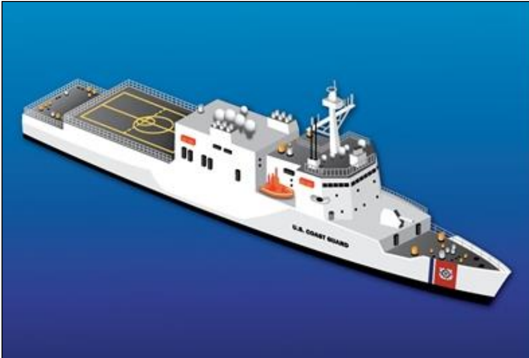
Figure 2. Offshore Patrol Cutter (Generic Conceptual Rendering)