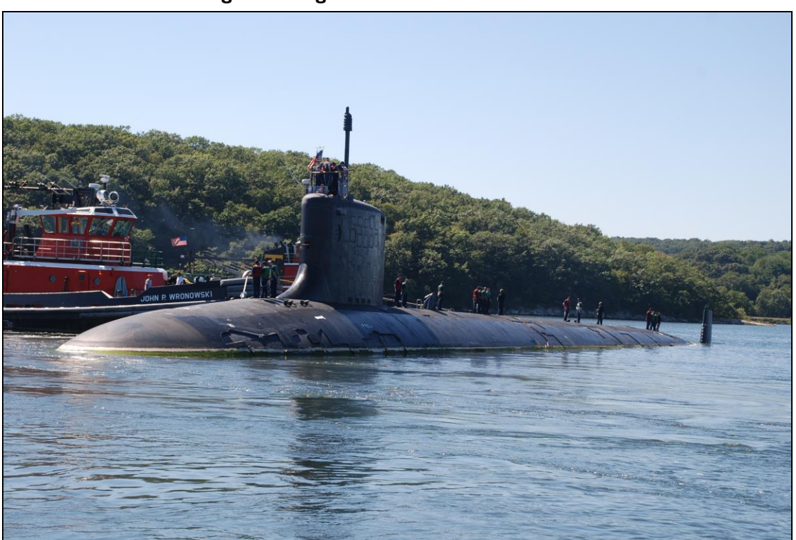
Figure I. Virginia-Class Attack Submarine