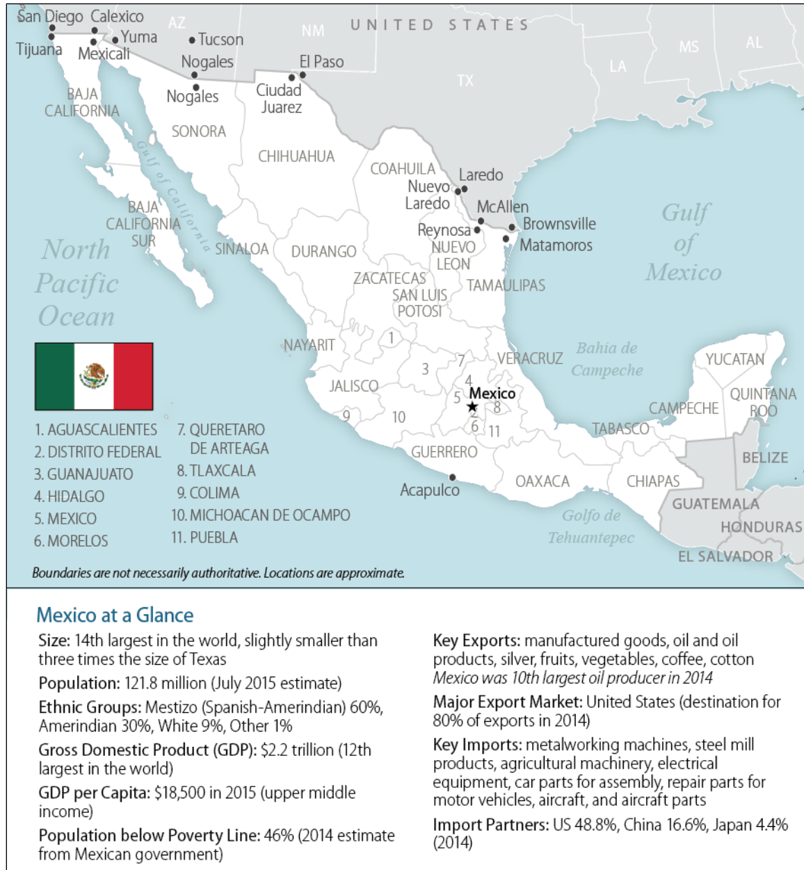
Figure I. Mexico at a Glance

Sources: Graphic created by the Congressional Research Service (CRS). Map files from Map Resources. Trade Data from Global Trade Atlas. Unless otherwise noted, other data are from CIA, The World Fact Book , updated February 2016.