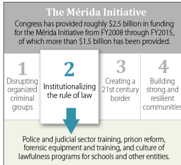
Figure 3. Pillars of the Mérida Initiative

Between FY2008 and FY2015, Congress appropriated almost $2.5 billion for Mérida Initiative programs in Mexico. (See Table 2 for recent Mérida Initiative aid figures and Table 3 for overall assistance figures). More than $1.5 billion worth of training, equipment, and technical assistance had been provided to Mexico as of December 2015. Mexico, for its part, has invested some $84 billion of its own resources on national security and public safety, including roughly $15.4 billion in 2016. 52