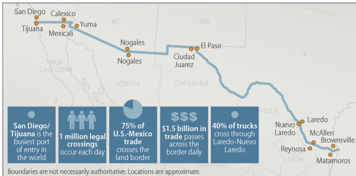
Figure 5. U.S.-Mexican Border

Source: U.S. Department of State data. CRS graphics.