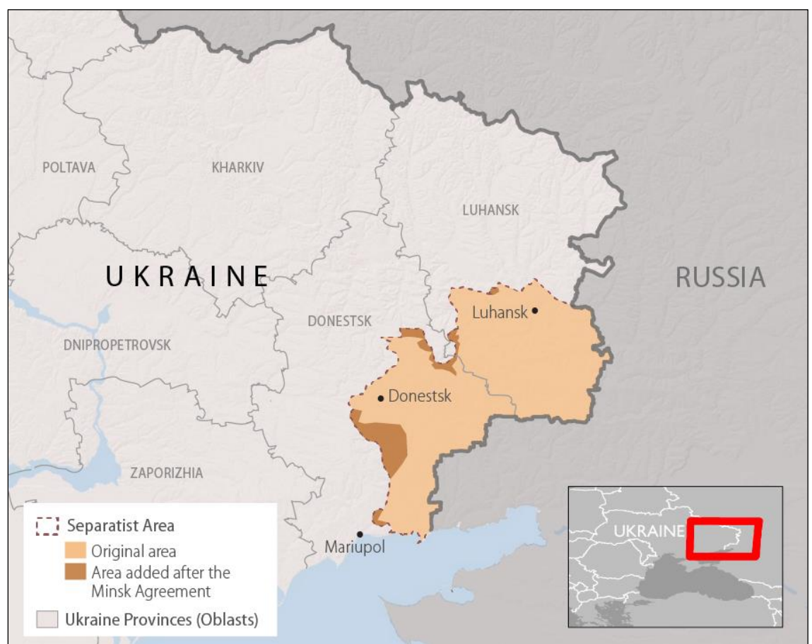
Figure 2. Separatists Areas in Ukraine

On May 11, 2014, the leaders of the armed separatist forces of the so-called Donetsk People's Republic (DNR) and the Luhansk People's Republic (LNR) held "referendums" on their "sovereignty." According to the organizers, the question of independence from Ukraine was approved by 89% of those voting in Donetsk region and by 96% in Luhansk region, with a turnout of 75%. No international observers monitored the vote, and witnesses reported rampant irregularities. The Ukrainian government denounced the referendums as illegal.