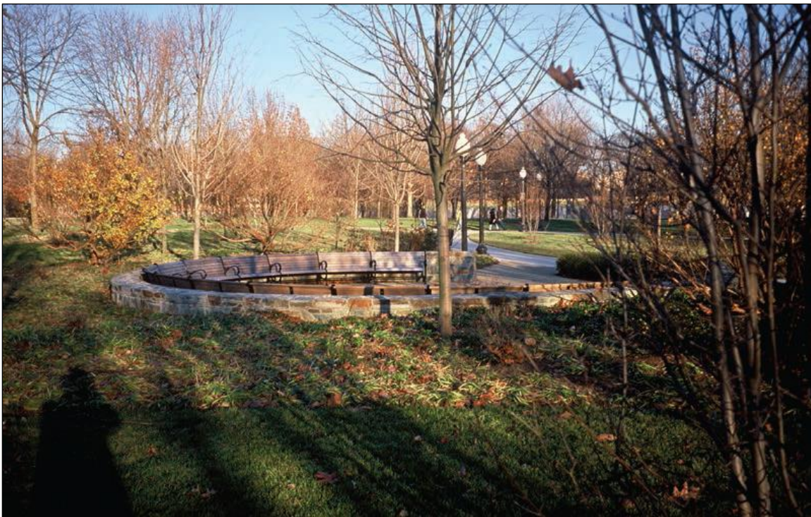
Figure 3. World War II Memorial Circle of Remembrance