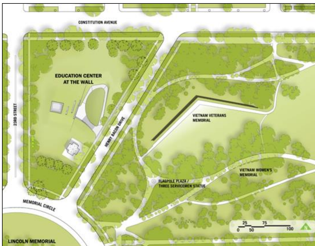
Figure 2. Map of Site for Vietnam Veterans Memorial Visitors Center