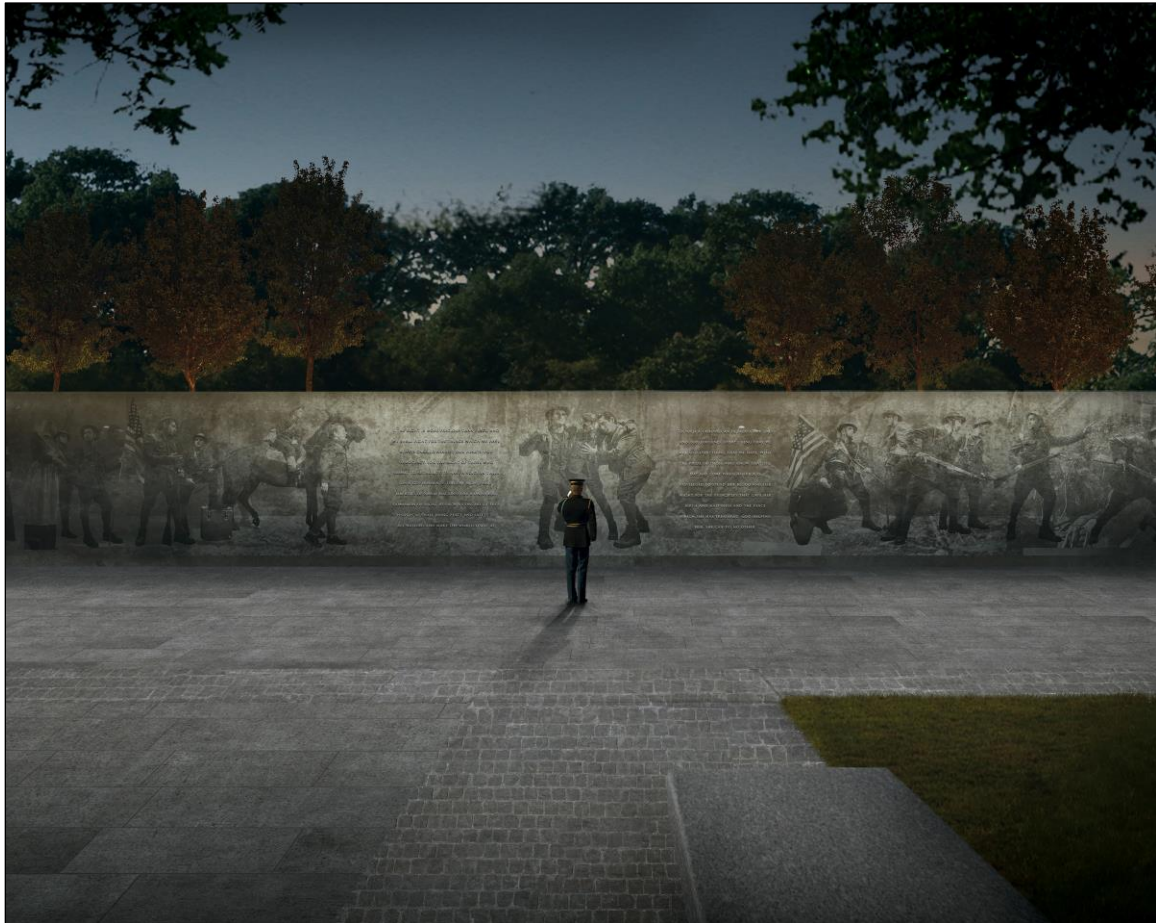
Figure 5. World War I Memorial “Weight of Sacrifice” Design Concept