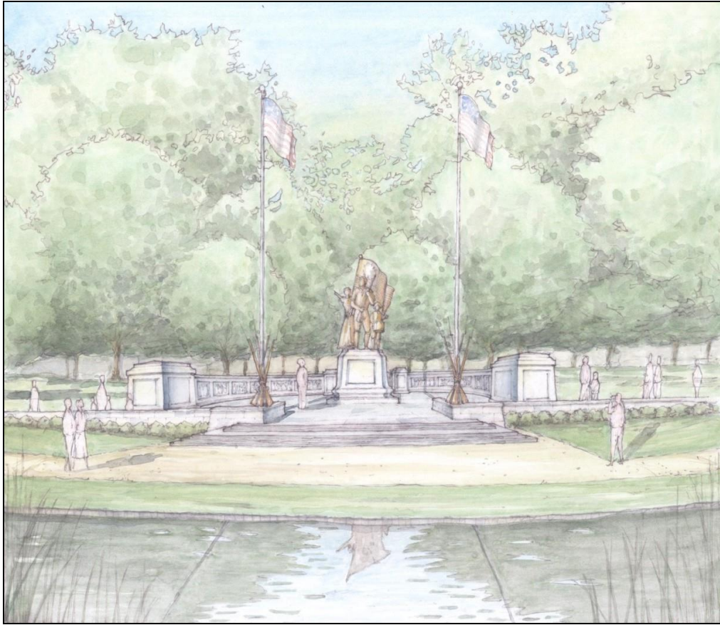
Figure 4. Slaves and Free Black Persons Who Served in the Revolutionary War Memorial Concept Design