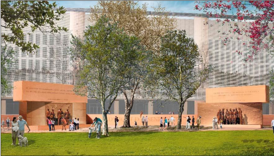
Figure 1. Dwight D. Eisenhower Memorial Approved Design