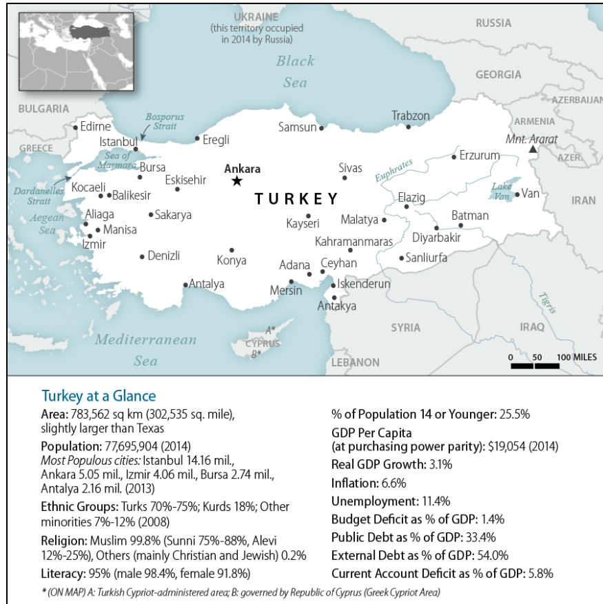
Figure I. Turkey: Map and Basic Facts

Sources: Graphic created by CRS. Map boundaries and information generated by (name redacted) using Department of State Boundaries (2011); Esri (2014); ArcWorld (2014); DeLorme (2014). Fact information (2015 estimates unless otherwise specified) from International Monetary Fund, Global Economic Outlook ; Turkish Statistical Institute; Economist Intelligence Unit; and Central Intelligence Agency, The World Factbook .