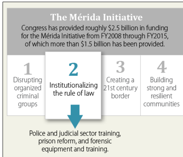
Figure I. Current Status and Focus of the Mérida Initiative

Appendix for overall U.S. assistance to Mexico since FY2010). In the beginning, Congress included funding for Mexico in supplemental appropriations measures in an attempt to hasten the delivery of certain equipment. Congress has also earmarked funds in order to ensure that certain programs are prioritized, such as efforts to support institutional reform. From FY2012 onward, funds provided for pillar two have exceeded all other aid categories. In FY2015, Congress provided $28.6 million above the Administration’s request, with additional funding for justice sector programs and efforts to help secure Mexico’s southern border.