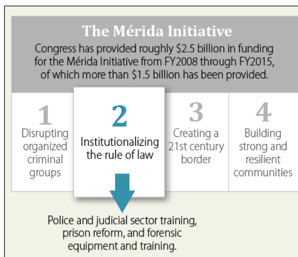
Figure 1. Current Status and Focus of the Mérida Initiative

Appendix for overall U.S. assistance to Mexico since FY2010). In the beginning, Congress included funding for Mexico in supplemental appropriations measures in an attempt to hasten the delivery of certain equipment. Congress has also earmarked funds in order to ensure that certain programs are prioritized, such as efforts to support institutional reform. From FY2012 onward, funds provided for pillar two have exceeded all other aid categories. In FY2015, Congress provided $28.6 million above the Administration's request, with additional funding for justice sector programs and efforts to help secure Mexico's southern border.