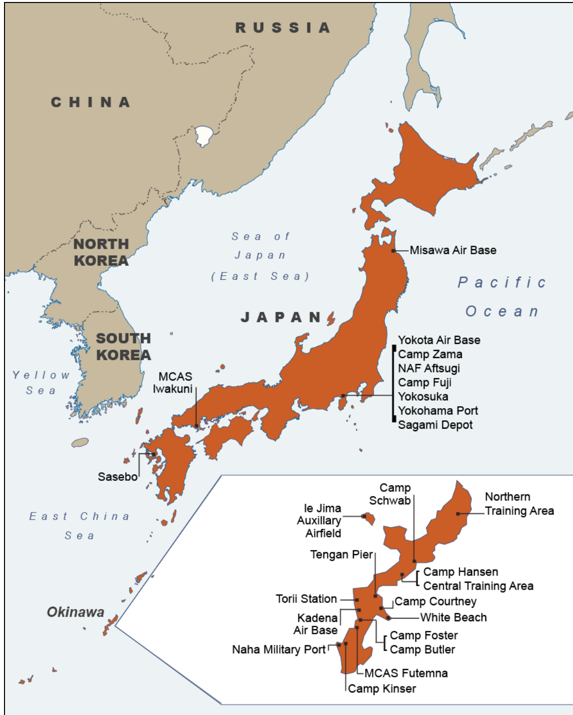
Figure 2. Map of U.S. Military Facilities in Japan