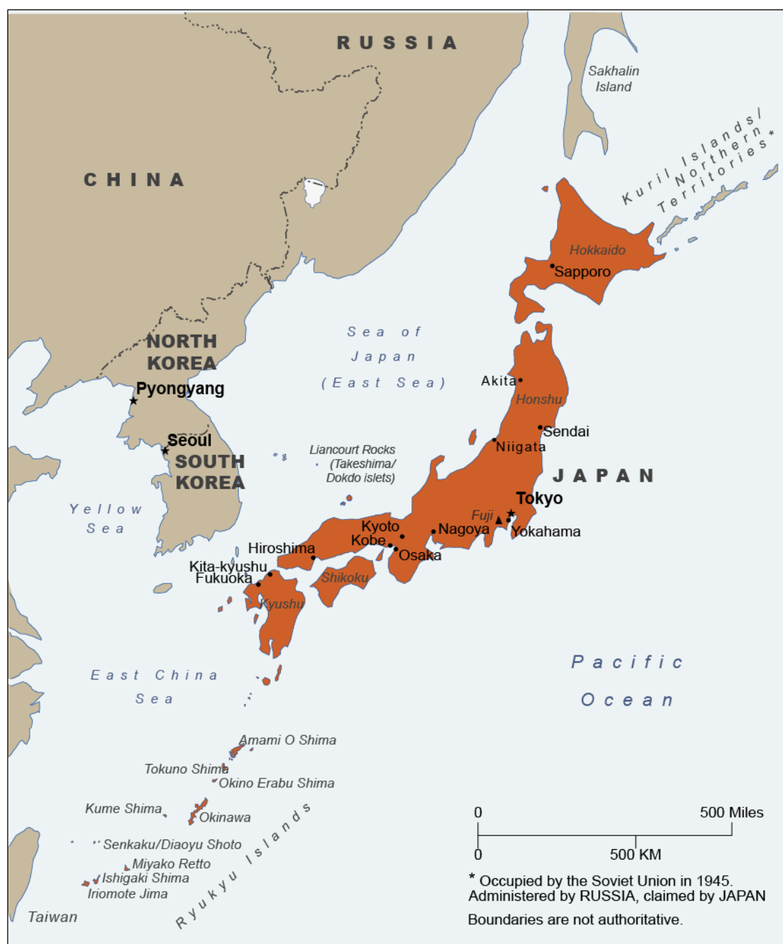
Figure I. Map of Japan and Surrounding Countries