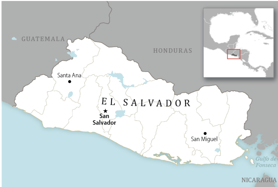
Figure 1. Map of El Salvador and Key Data on the Country

U.S. involvement in countering the insurgency in El Salvador could make relations with the Sánchez Cerén government difficult, bilateral relations have remained friendly.