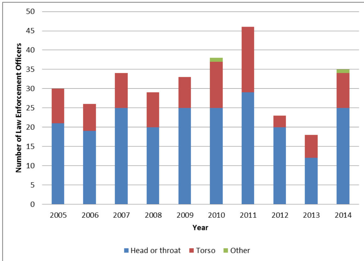
Figure 2. Location of Fatal Wound for Law Enforcement Officers Killed with a Firearm While Wearing Body Armor