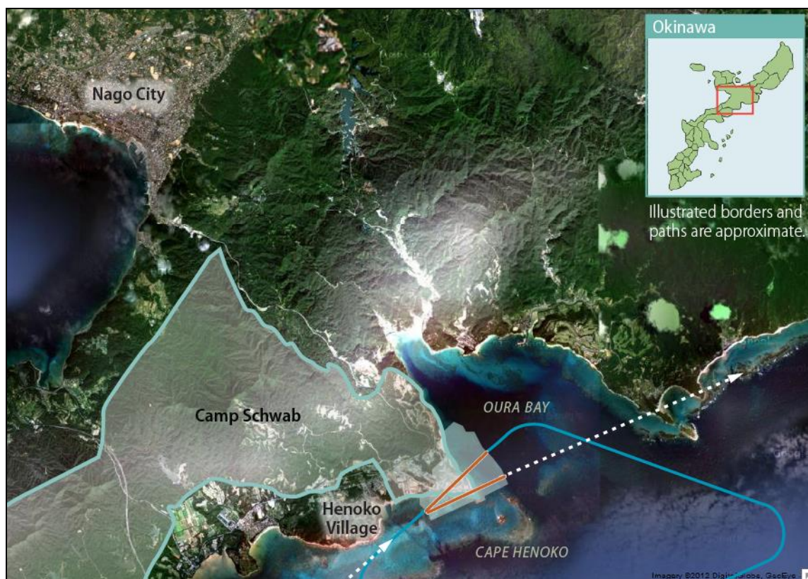
Figure 3. Location of Proposed Futenma Replacement Facility