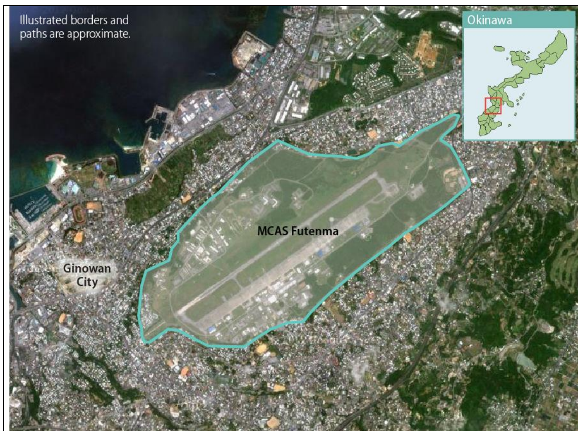
Figure 4. MCAS Futenma

The base is located within a dense urban area, surrounded by schools and other facilities that are subjected to the high noise levels that accompany an active military training site. (See Figure 4 .) A new equipment accident or serious crime committed by a U.S. servicemember could galvanize further Okinawan opposition to the U.S. military presence on the island.