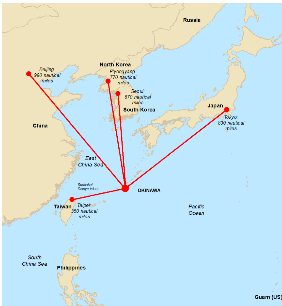
Figure 2. Okinawa's Strategic Location