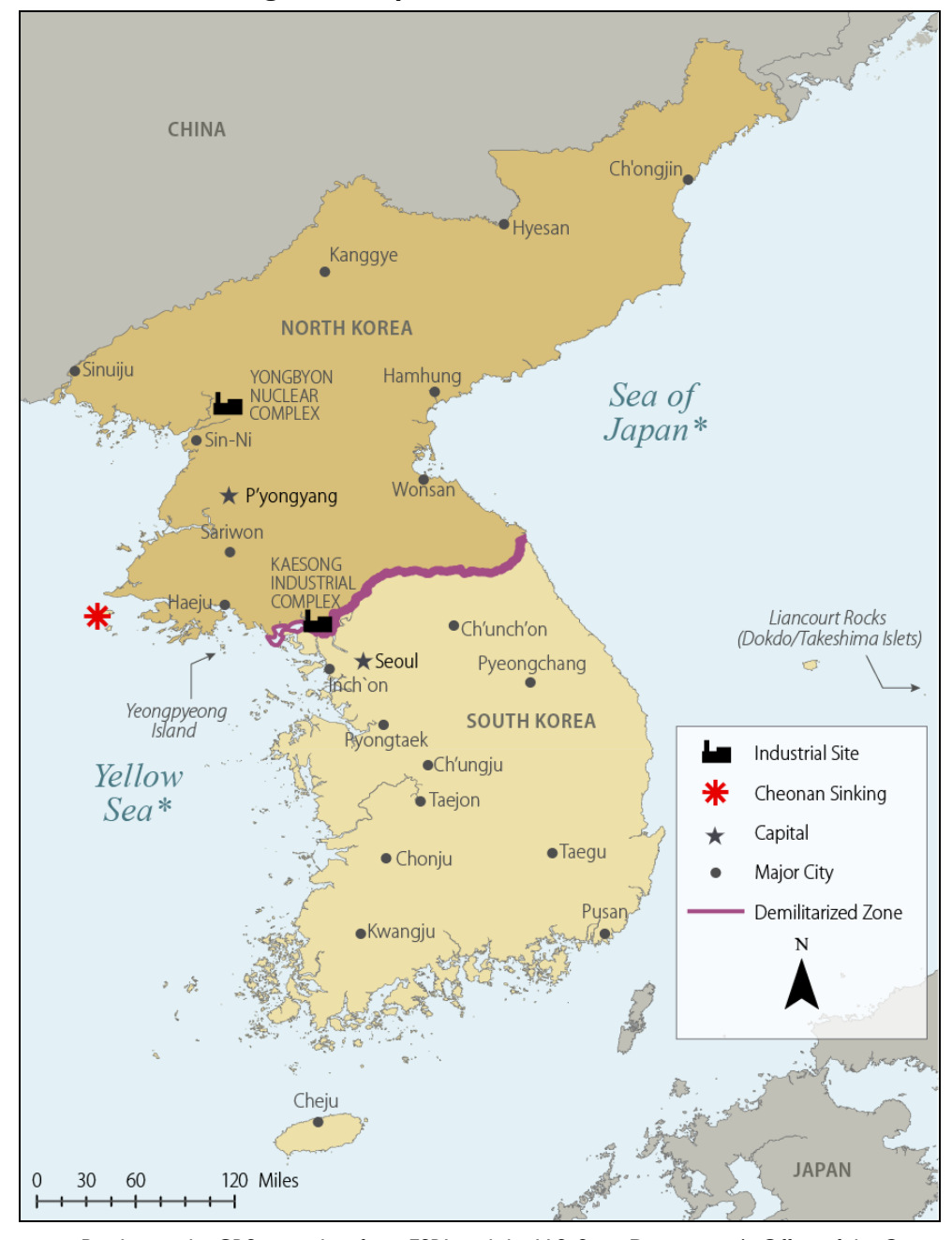
Figure 1. Map of the Korean Peninsula