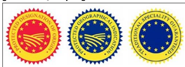
Figure 1. EU Quality Registration Markers

More than 4,560 product names are registered and protected in the EU for foods, wine, and spirits originating in EU member states (about 3,400 registrations) and also in other countries (another 1,160 registrations). See Table 1 . Most product registrations under the EU’s system originate in the EU—mostly Italy, France, and Spain—however, countries outside the EU have also registered product names under the EU’s quality scheme, including products from Eastern