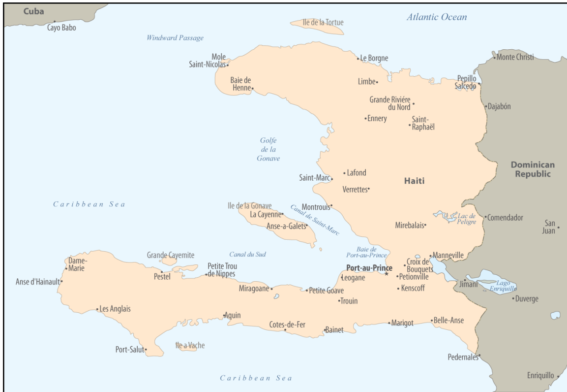
Figure I. Map of Haiti