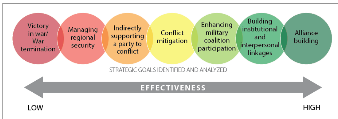
Figure 1. BPC Effectiveness by Strategic Rationale in Cases Explored

This report examines between two and four case studies for each strategic-level rationale, for a total of 20 cases. 3 The overall results are depicted in Figure 1 below: