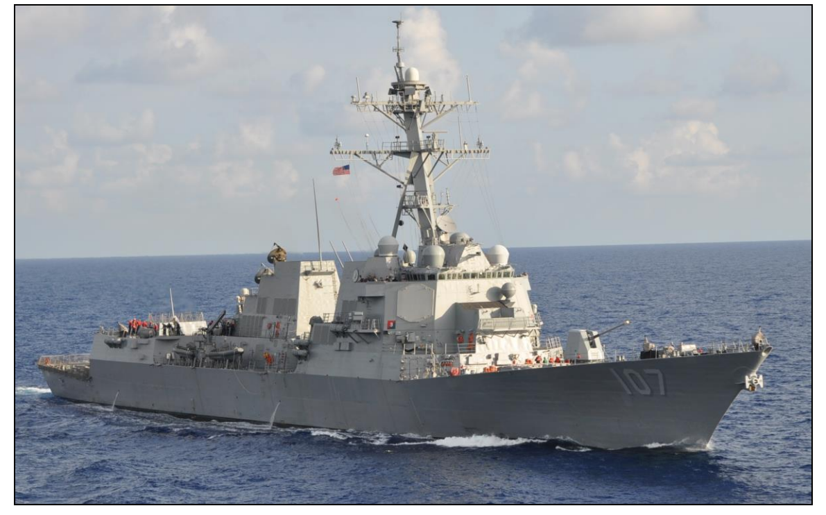
Figure 1. DDG-51 Class Destroyer

the end of FY2014. DDG-51s are built by General Dynamics Bath Iron Works (GD/BIW) of Bath, ME, and Ingalls Shipbuilding of Pascagoula, MS, a division of Huntington Ingalls Industries (HII).