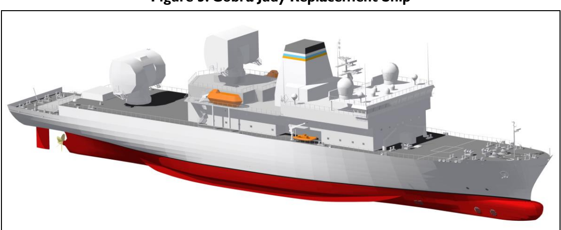
Figure 3. Cobra Judy Replacement Ship