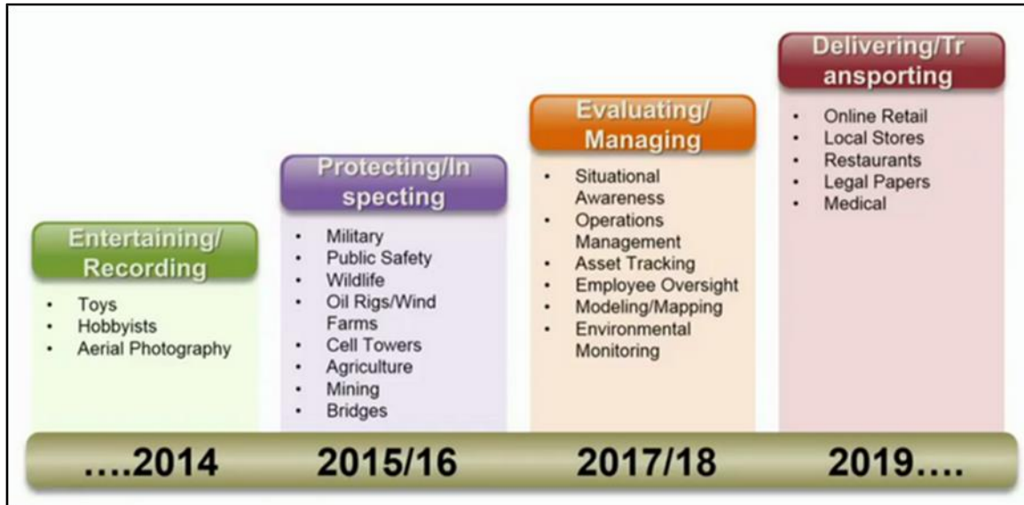
Figure 2. Potential Growth in Commercial Use of UAS