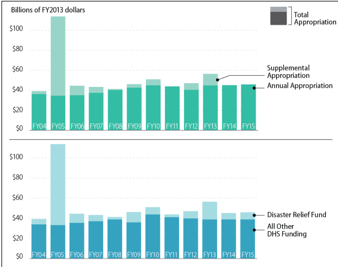
Figure 2. DHS Appropriations, FY2004-FY2015, Showing Supplemental Appropriations and the DRF (in billions of constant FY2013 dollars)