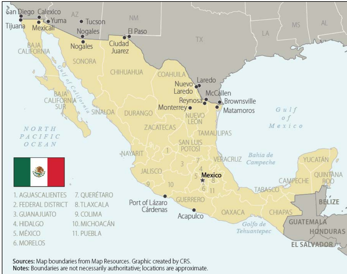
Figure I. Map of Mexico