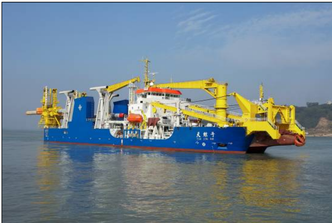
Figure 3. The Tianjing (“Sky Whale”) Self-Propelled Cutter Suction Dredger Involved in Reclamation Work in the Spratly Islands