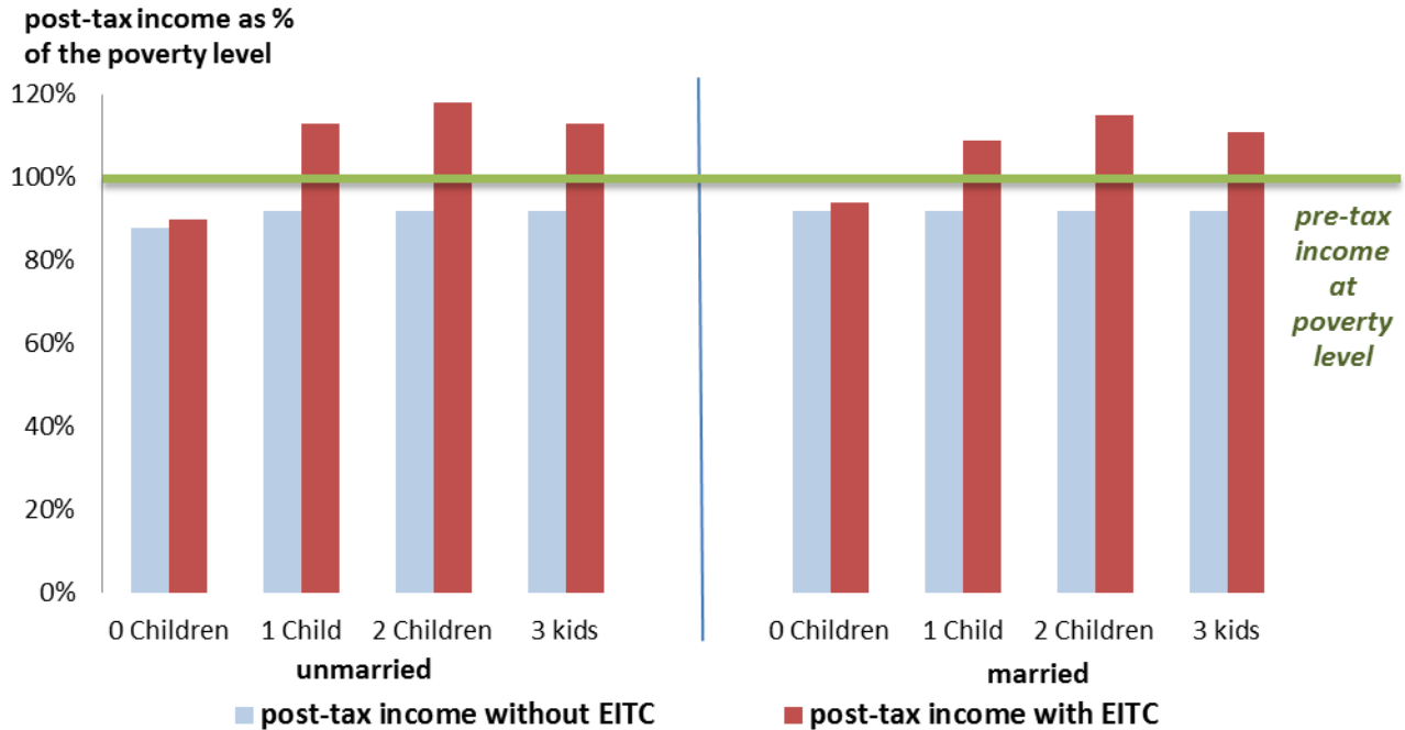
Figure 2. Effects of Taxes and EITC on Taxpayers at Poverty Level, 2014

The antipoverty effects of the EITC are not uniform across different types of households and tax filers. Figure 2 illustrates how pre-tax income of workers at the federal poverty level (FPL) 57 changes after subtracting taxes owed (including payroll taxes) and adding back the EITC. Under the current federal income tax, married and unmarried childless workers with pre-tax income at the FPL tend to see their income remain below the poverty line after taxation, even when including the EITC . In contrast, married and unmarried workers with children whose pre-tax income is at the FPL will have post-tax income above the FPL because the EITC is greater than their payroll tax liability. Many poor tax filers, especially those with children, do not generally owe federal income tax . 58