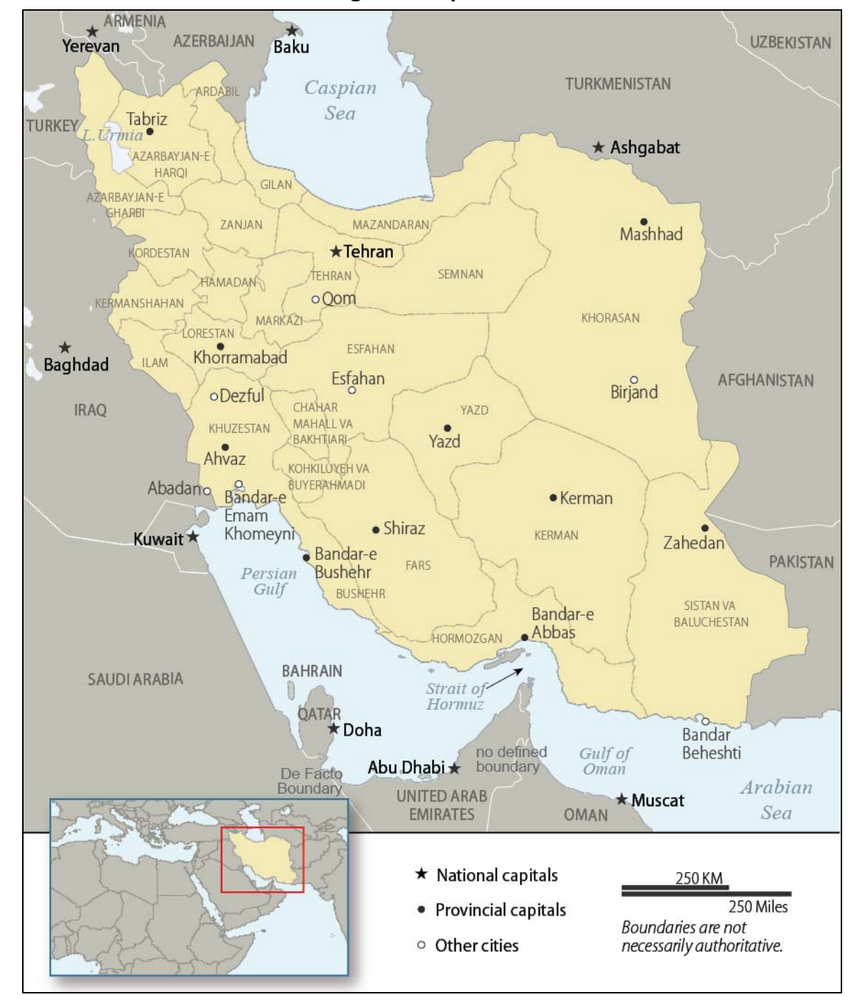
Figure 3. Map of Iran