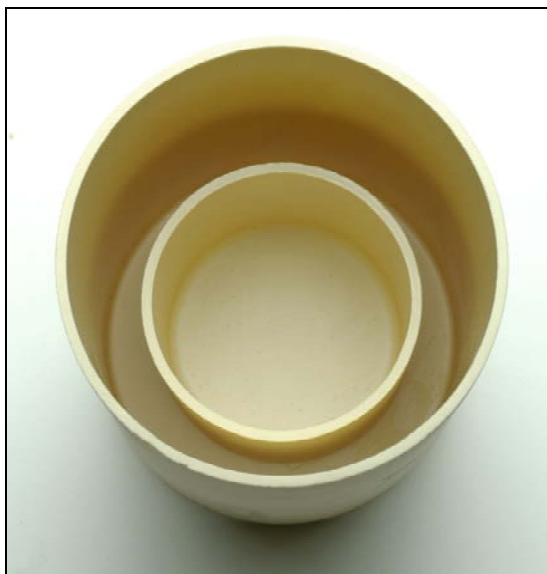
Figure 3.A Crucible for Electrorefining Plutonium