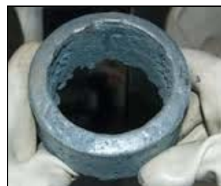
Figure 4. Electrorefined Plutonium

In electrorefining, an ingot of impure plutonium is placed in a small magnesium oxide crucible at the bottom center of a larger crucible of the same material. (See Figure 3. ) The rest of both crucibles are filled with a salt mixture (sodium chloride and potassium chloride) that acts as an electrolyte. Both are melted at 740°C, well above the melting point of plutonium (639°C). An electric current is used; the anode is a tungsten rod inserted into the molten plutonium and the cathode is a circular ribbon of tungsten in the molten salt above and outside the inner ring. The current draws plutonium atoms through the salt to the cathode, where drops of metallic plutonium fall into the space between the two crucibles, forming a ring. (See Figure 4. ) The United States has used this process for decades, so it is well characterized—a major advantage.