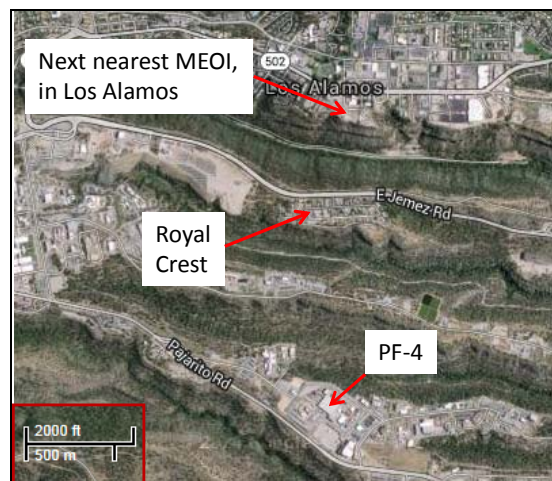
Figure 1. Royal Crest, PF-4, Los Alamos