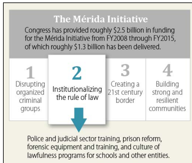
Figure 2. Current Status and Focus of the Mérida Initiative

Congress, with the power of the purse, has played a major role in determining the level and composition of Mérida Initiative funding for Mexico. 27 From FY2008 to FY2015, Congress appropriated more than $2.5 billion for Mexico under the Mérida Initiative (see Table 1 for Mérida appropriations and Table A-1 in Appendix for overall U.S. assistance to Mexico since FY2010). In the beginning, Congress included funding for Mexico in supplemental appropriations measures in an attempt to hasten the delivery of certain equipment. Congress has also earmarked funds in order to ensure that certain programs are prioritized, such as efforts to support institutional reform. From FY2012 onward, funds provided for pillar two have exceeded all other aid categories (see Figure 2 ). In FY2015, Congress provided $79 million above the Administration’s request of $115 million for the Mérida Initiative in P.L. 113-235 to be used for helping Mexico secure its southern border and implement justice sector reforms. The bulk of the $119 million in funds requested by the Obama Administration for FY2016 would continue work on helping Mexico implement judicial and police reform.