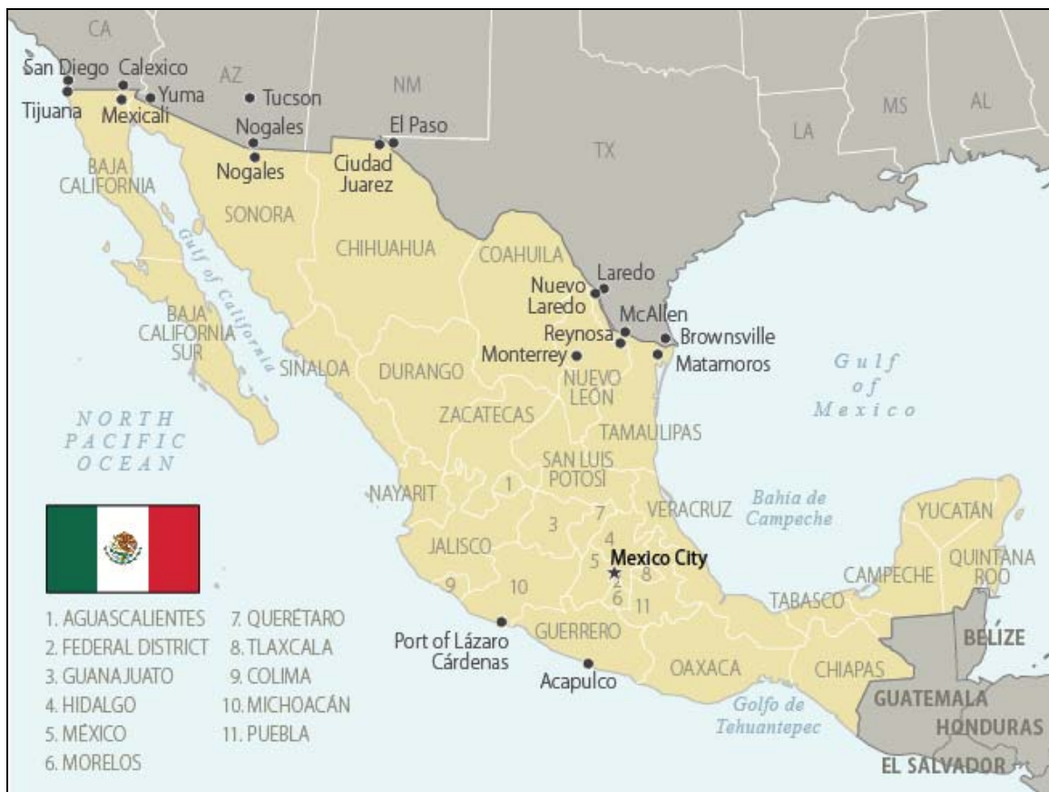
Figure 1. Map of Mexico