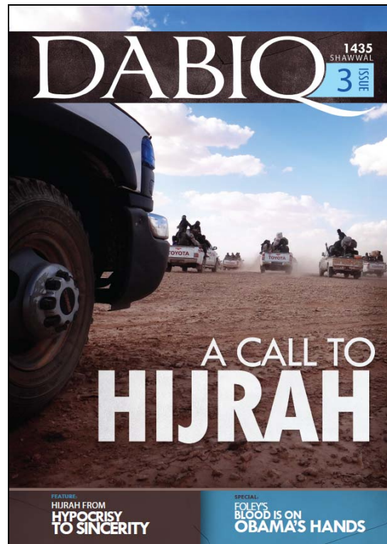
Figure B-1. Islamic State Seeks Recruits