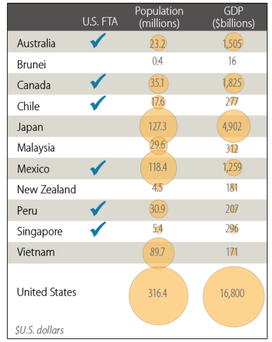
Figure I. TPP Country Demographics

The United States is the largest country in the negotiations, both in terms of population and gross domestic product (GDP), with Japan second in both categories ( Figure 1 ). The United States has existing FTAs in place with six of the other TPP countries, including Canada and Mexico. It does not have an FTA with Brunei, Japan, Malaysia, New Zealand, or Vietnam.