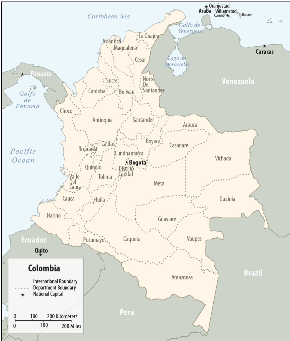
Figure I. Map of Colombia Showing Departments and Capital