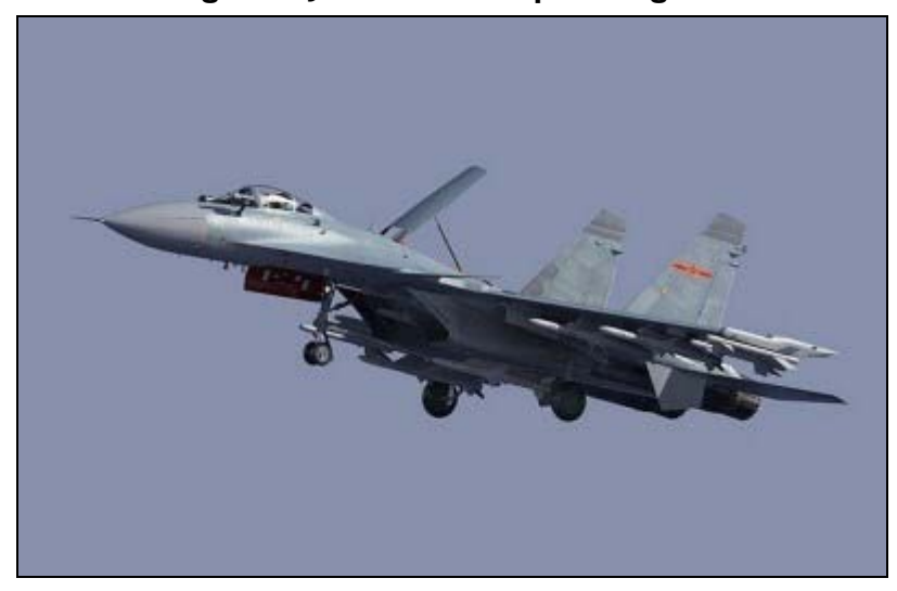
Figure 6. J-15 Carrier-Capable Fighter