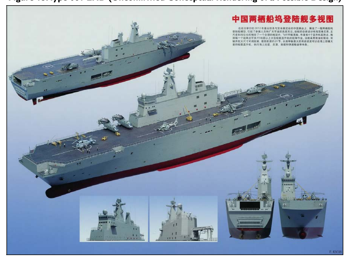
Figure 13.Type 081 LHD (Unconfirmed Conceptual Rendering of a Possible Design)

By comparison, U.S. Navy LHD/LHA-type amphibious assault ships displace 41,000 to 45,000 tons. Figure 13 shows an unconfirmed conceptual rendering of a possible design for the Type 081 LHD.