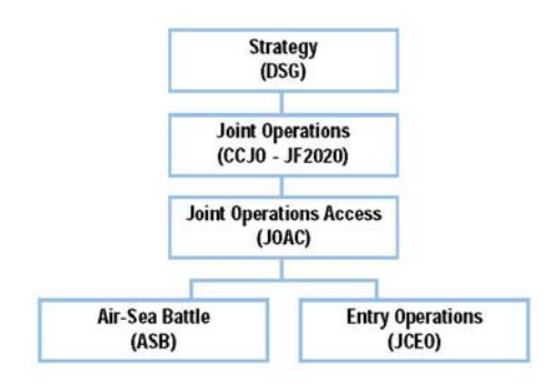
Figure 2. Relationship between Strategy, CCJO, JOAC, JCEO & ASB

JCEO, at the same level as ASB, will focus on guiding force development to enable joint force entry operations in an A2/AD environment. ASB can be seen to support JCEO by covering that freedom of action and access requirements in the global commons that ultimately support the joint force's ability to conduct concurrent or follow-on entry operations.