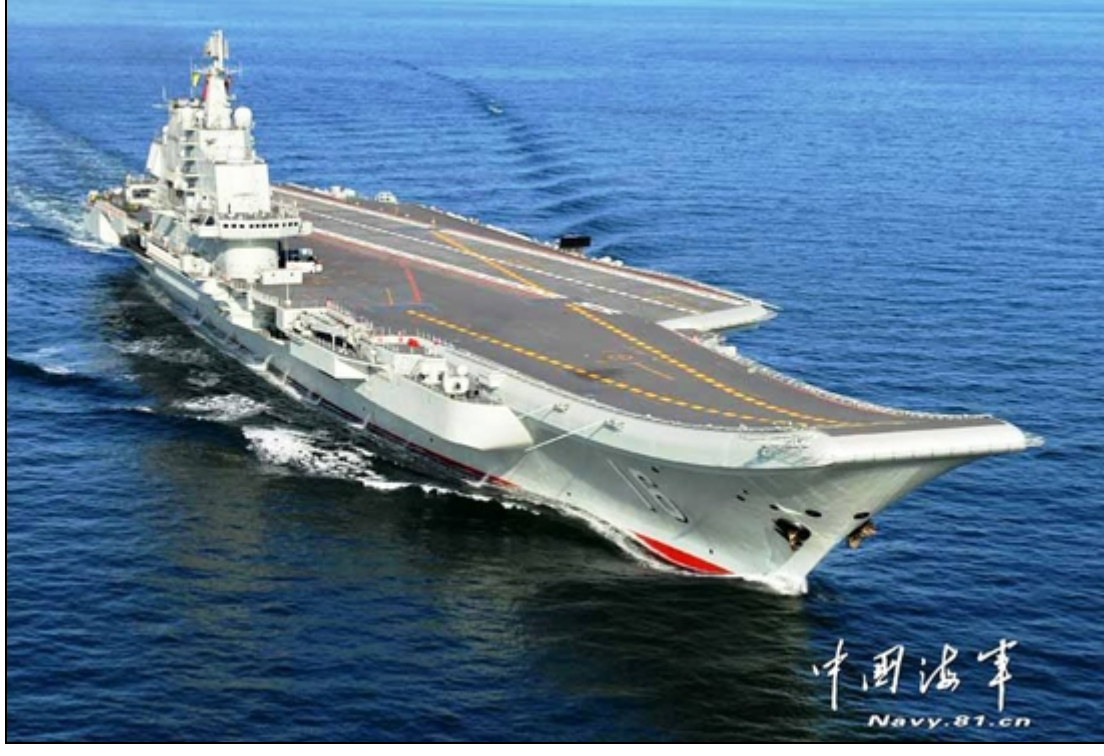
Figure 5. Aircraft Carrier Liaoning (ex-Varyag)

ship's home port was shifted from Dalian to the PLA Navy's Yuchi naval base, located in the North Sea Fleet.<sup>43</sup>