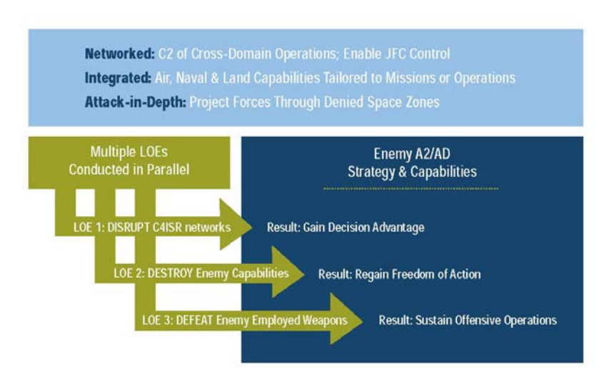
Figure 1. Components of ASB's Conceptual Design 'NIA/D3'

Cross-domain operations are conducted by integrating capabilities from multiple interdependent warfighting domains to support, shape, or achieve objectives in other domains. Cross-domain operations are those that can exploit asymmetric advantages in specific domains to create positive and potentially cascading effects in other domains. For cross-domain operations to be fully effective, commanders, whether defending or attacking, must have ready access to capabilities, no matter what domain they reside in or which commander owns them, to support or achieve operational objectives and create the effects required for advantage over an adversary. This interoperability may require multi-pathing, or the ability to use multiple, alternative paths from among all domain capabilities to achieve a desired end. While cross-domain operations are more complex than single domain or single Service options, their multi-pathing possibilities can provide distinct operational advantages over single domain or single Service solutions to operational problems.