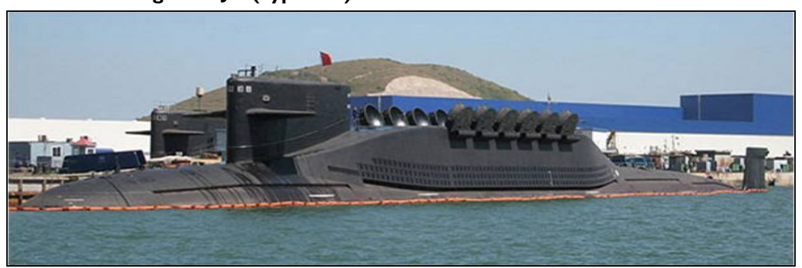
Figure 1. Jin (Type 094) Class Ballistic Missile Submarine