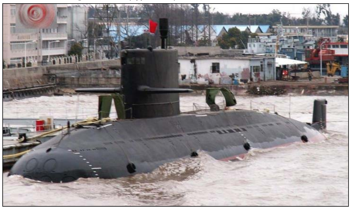
Figure 2. Yuan (Type 039A) Class Attack Submarine

China seeks some high-tech components and certain major end items, particularly from Russia, that it has difficulty producing domestically. China is pursuing... a new joint-design and production program for diesel-electric submarines based on the Russian PETERSBURG/LADA-class.<sup>30</sup>