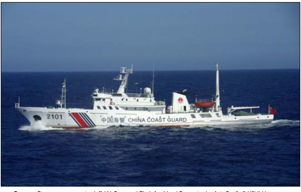
Figure 11. China Coast Guard Ship