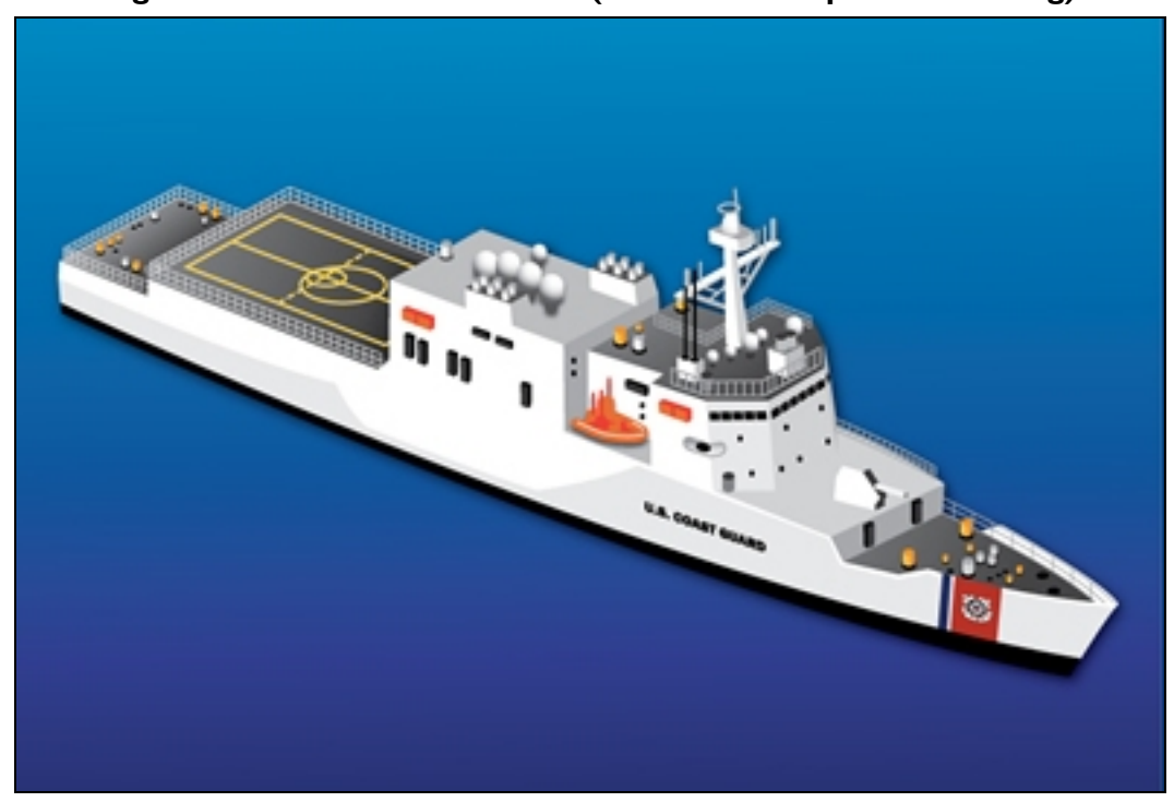
Figure 2. Offshore Patrol Cutter (Generic Conceptual Rendering)