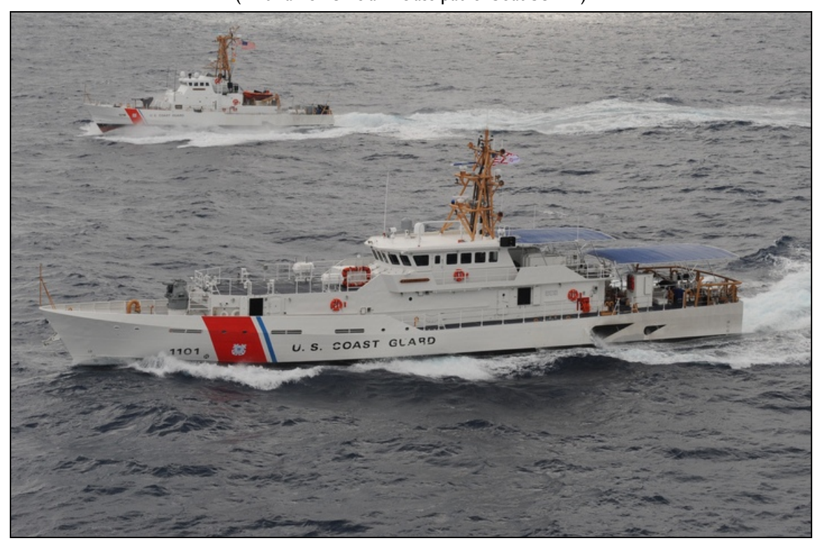
Figure 3. Fast Response Cutter (With an older Island-class patrol boat behind)