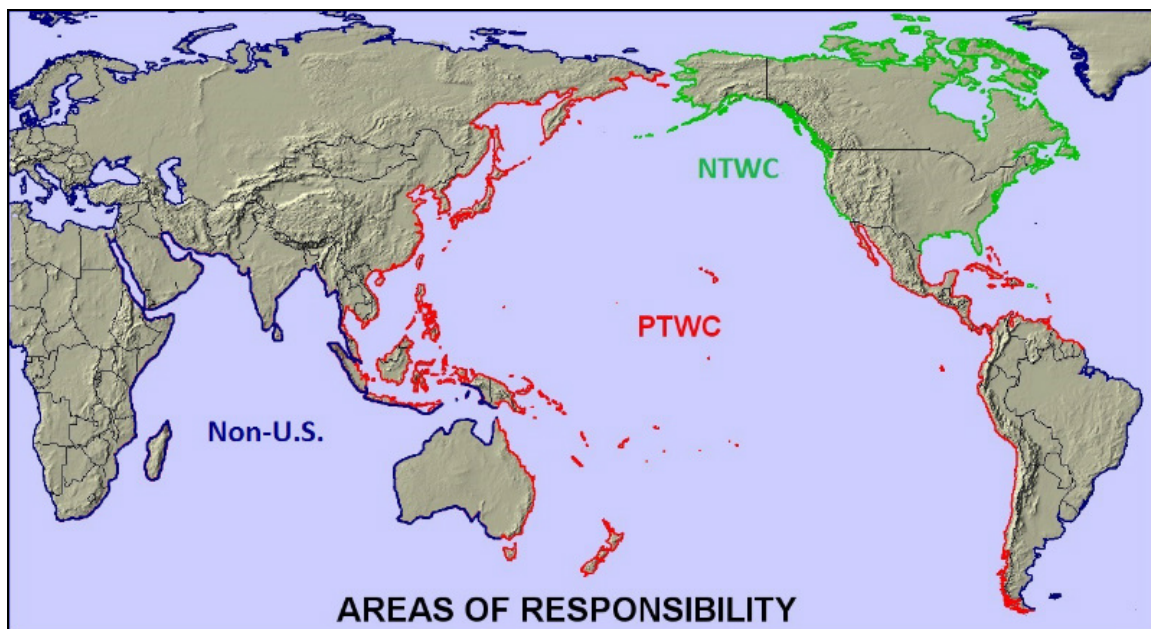
Figure 1. Areas of Responsibility for the Pacific Tsunami Warning Center (PTWC) and the National Tsunami Warning Center (NTWC)

Source: National Oceanic and Atmospheric Administration, National Weather Service, National Tsunami Hazard Mitigation Program, at http://nws.weather.gov/nthmp/ .