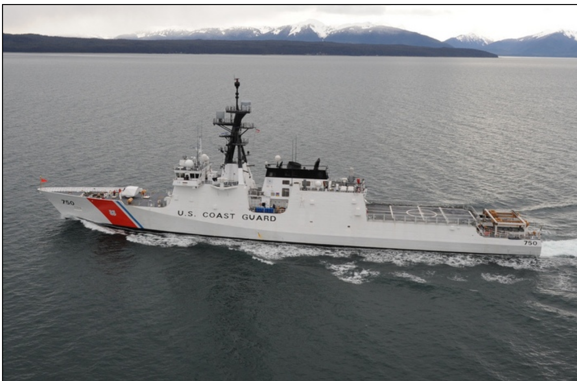
Figure 1. National Security Cutter