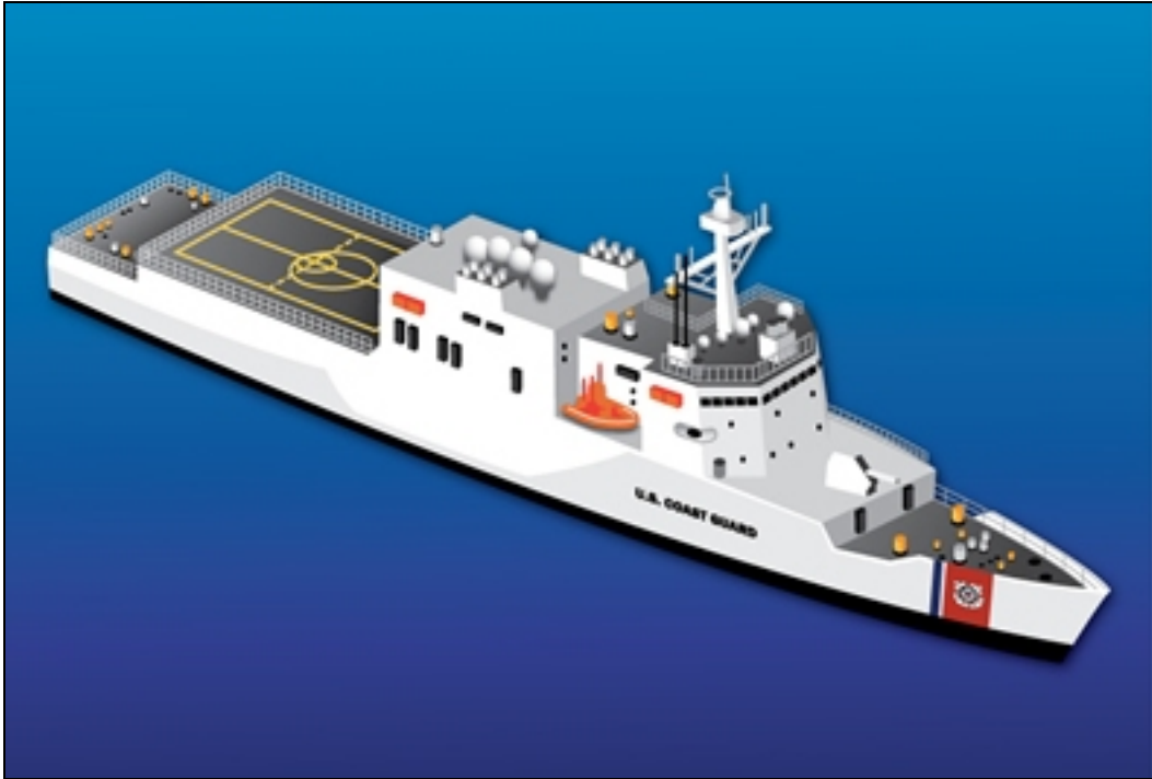
Figure 2. Offshore Patrol Cutter (Generic Conceptual Rendering)