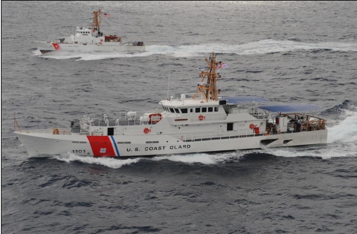
Figure 3. Fast Response Cutter (With an older Island-class patrol boat behind)