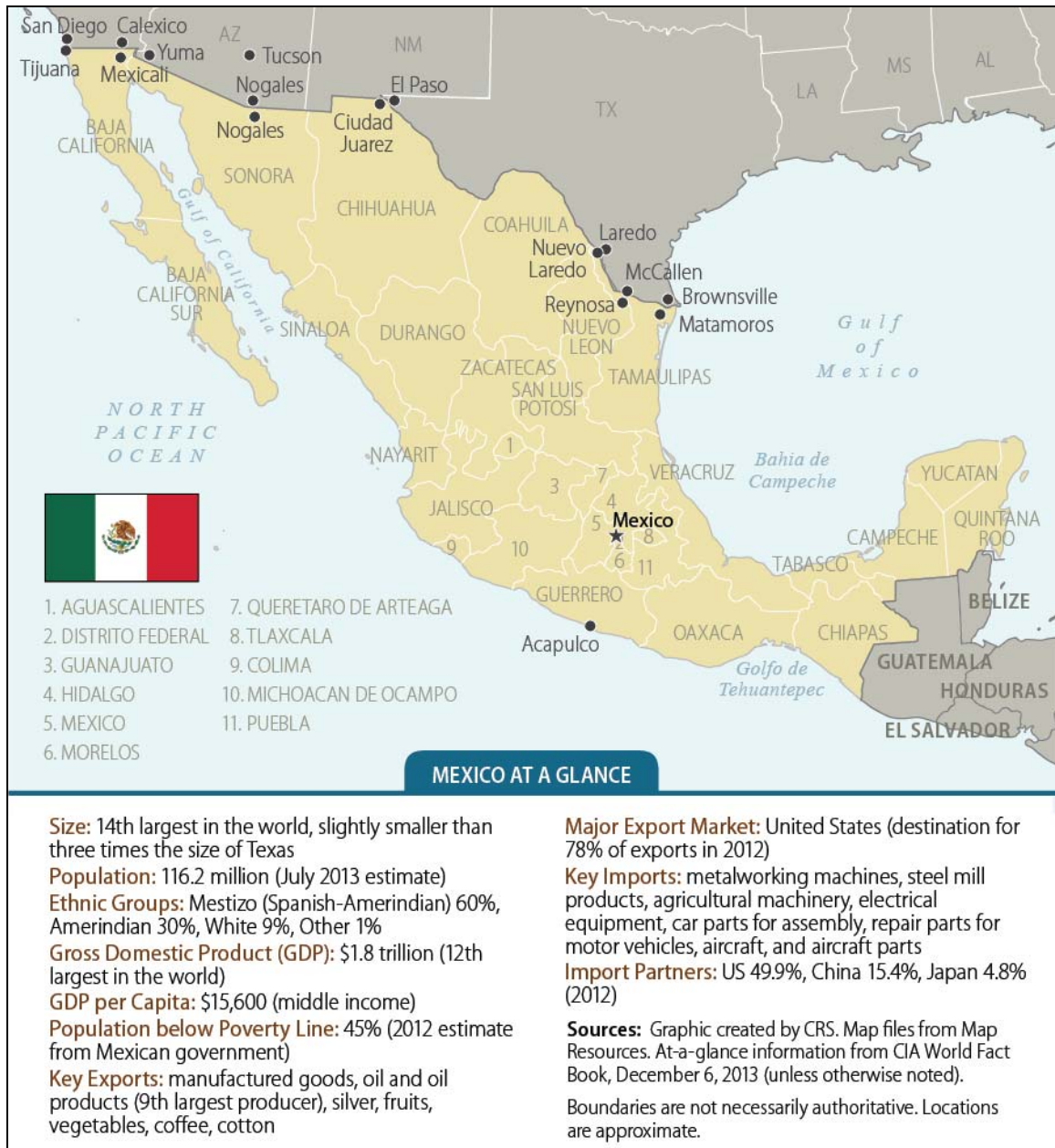
Figure I. Mexico at a Glance

Congress, Supreme Court, and increasingly powerful governors. 4 Partially as a result of those constraints, two successive National Action Party (PAN) administrations struggled to enact the structural reforms needed to boost Mexico’s economic competitiveness and effectively address the country’s security challenges.