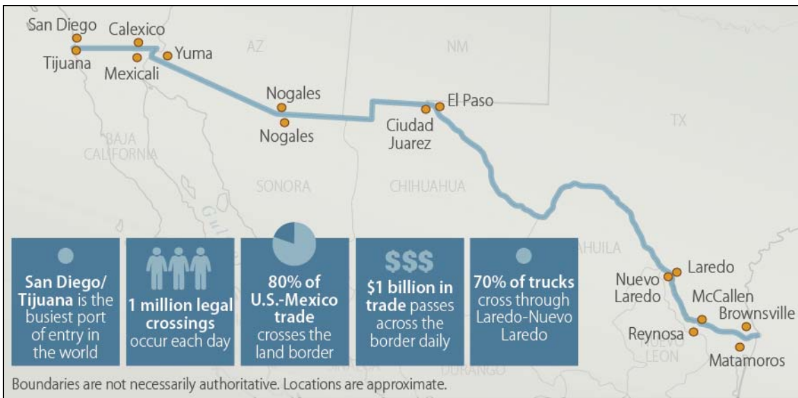
Figure 3. Snapshot of the U.S.-Mexico Border

On May 19, 2010, the United States and Mexico declared their intent to collaborate on enhancing the U.S.-Mexican border as part of pillar three of the Mérida Initiative. 96 A Twenty-First Century Border Bilateral Executive Steering Committee (ESC) has met six times since then to develop bi-national action plans and oversee implementation of those plans. The plans are focused on setting measurable goals within broad objectives: coordinating infrastructure development, expanding trusted traveler and shipment programs, establishing pilot projects for cargo pre-clearance, improving cross-border commerce and ties, and bolstering information sharing among law enforcement agencies. In October 2014, the U.S. and Mexican governments reported that their efforts had resulted in a reduction in wait times at San Isidro from two to three hours to 30 minutes, the opening of the first railroad crossing in 100 years, and the mutual recognition of each country’s respective trusted shipper program. 97