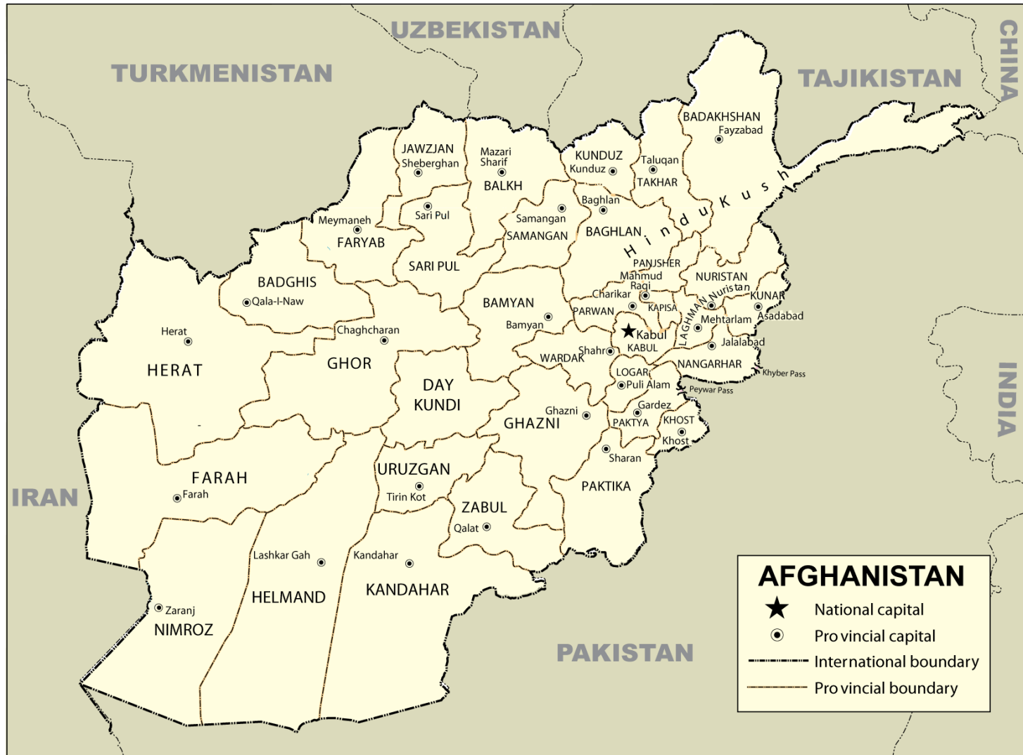
Figure A-1. Map of Afghanistan