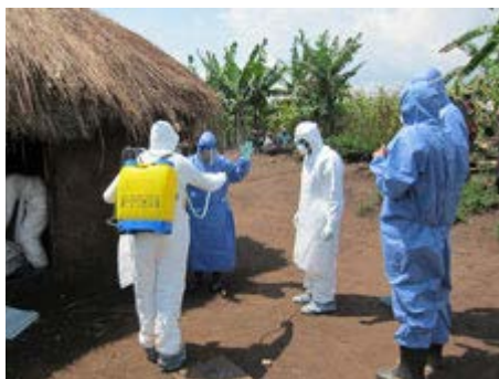
Figure 2. Healthcare Workers in Personal Protective Equipment

Ebola infection has a high mortality rate , often killing more than half of those who are infected. Supportive treatment such as intravenous hydration lowers the death rate somewhat. The two infected American healthcare workers who returned to the United States are reported to have received an experimental antibody treatment for the disease. The U.S. National Institutes of Health (NIH) plans to begin clinical trials on a candidate vaccine in the fall of 2014.