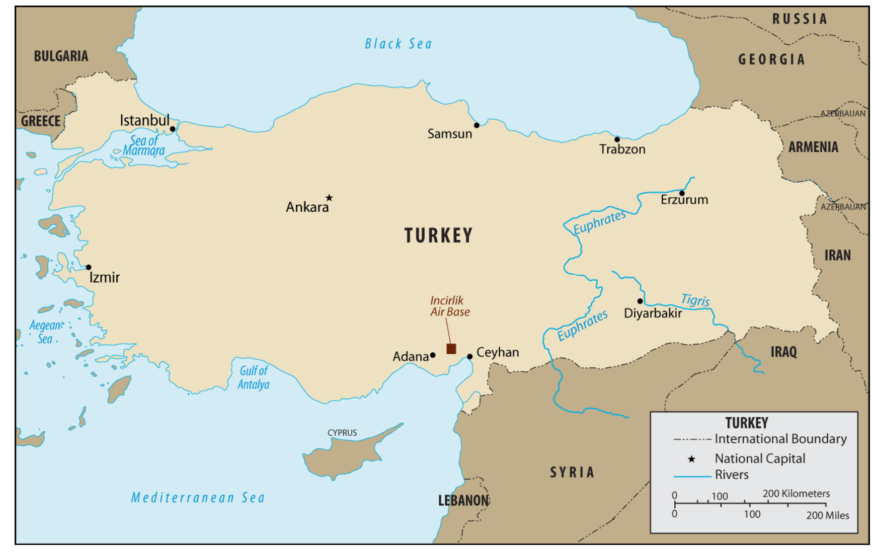
Figure 1.Turkey and Its Neighbors