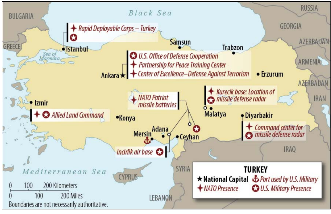
Figure 2. Map of U.S. and NATO Military Presence in Turkey

Sources: Department of Defense, NATO, Hurriyet Daily News; adapted by CRS.