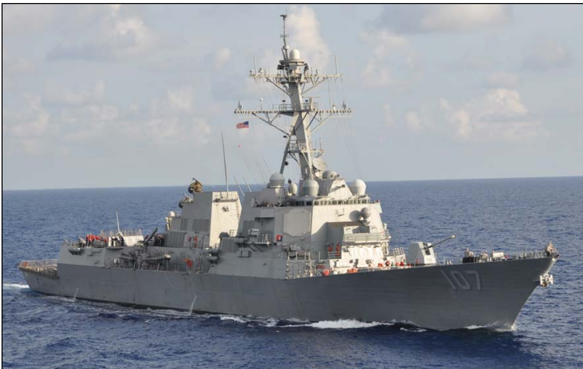
Figure I. DDG-51 Class Destroyer