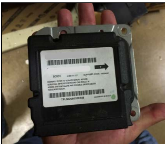
Figure 1. An Event Data Recorder