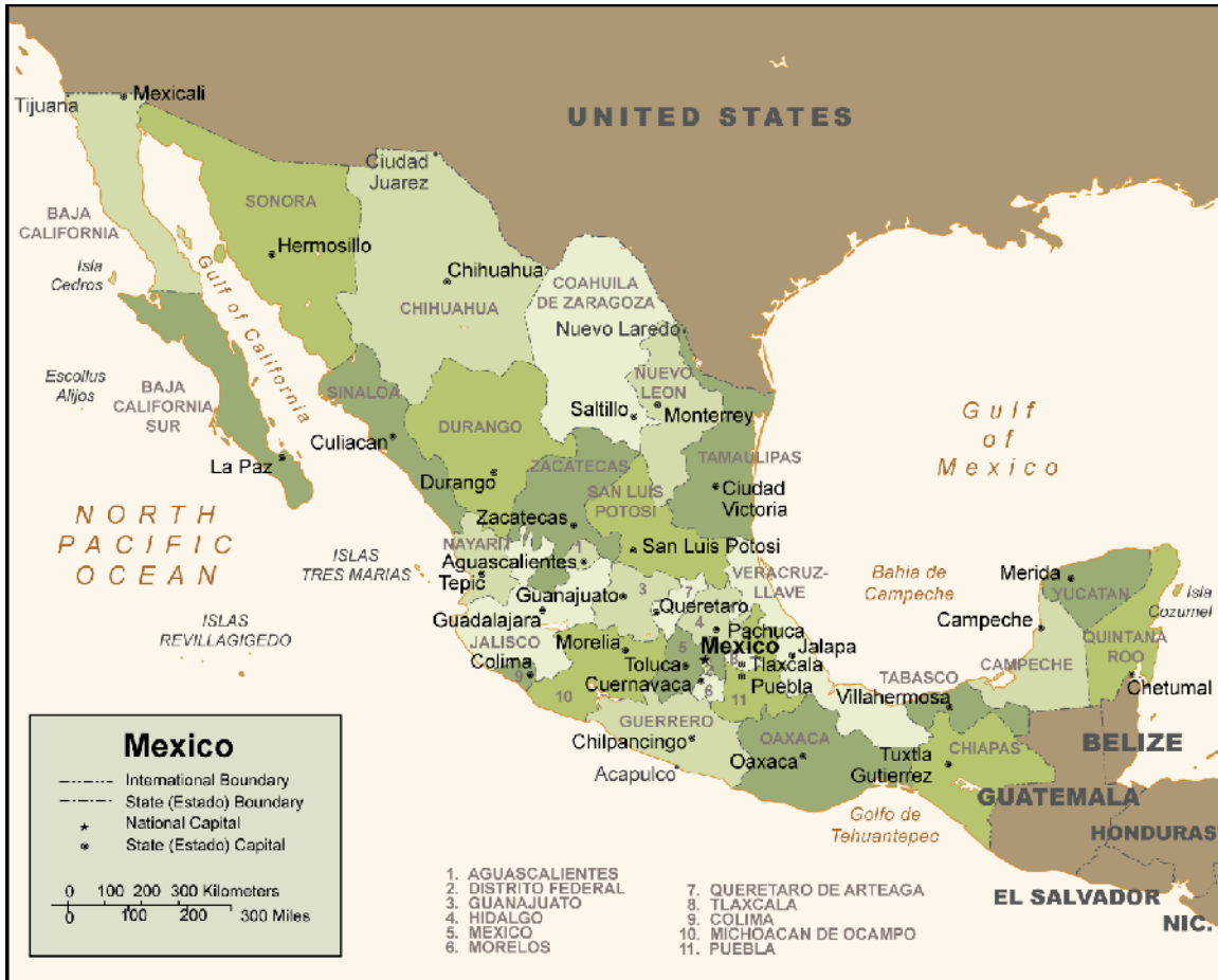
Figure A-I. Map of Mexico