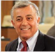
Figure I. Select Libyan and U.S. Figures