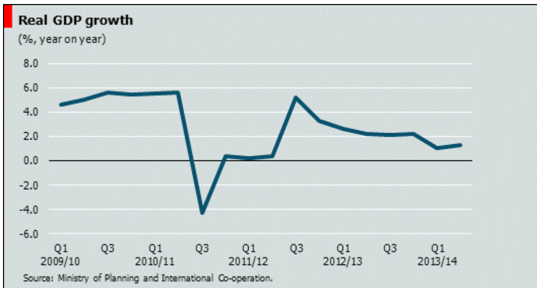
Figure 3. Egypt's Real GDP Growth

Egypt's economy is barely growing; economists project perhaps 2% growth for the current Egyptian fiscal year, an amount that just exceeds the country's annual population growth rate. 34 For Egypt, the good news is that the economy is no longer contracting, as some foreign direct investment has returned, and foreign currency reserves are no longer dwindling, stabilizing at $17.4 billion as of April 2014. They had been at $36 billion before unrest began in 2011.