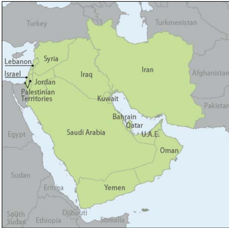
Figure 1. Countries in or Near the Arabian Peninsula for Which Travel Precautions Are Recommended