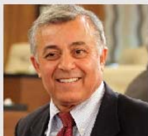
Figure 1. Select Libyan and U.S. Figures