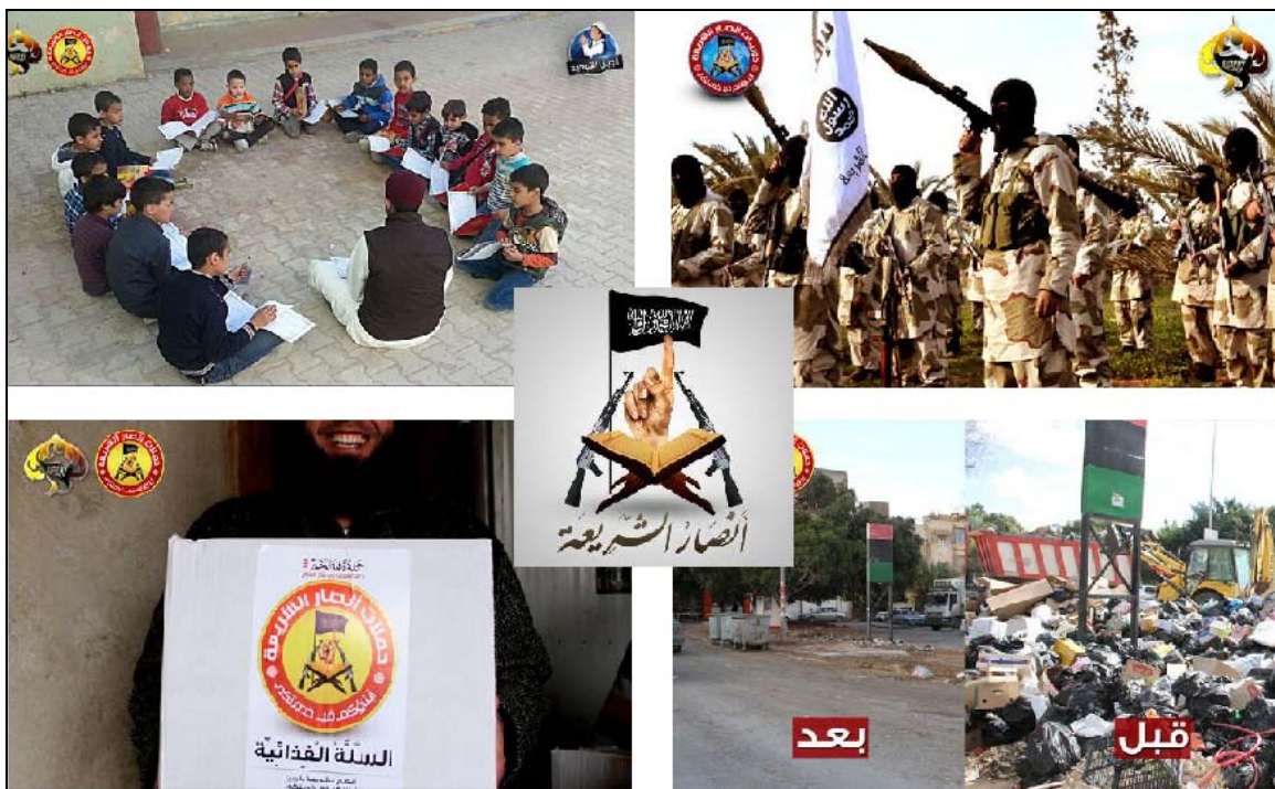
Figure 3. Recent Ansar al Sharia Imagery from Libya and Syria