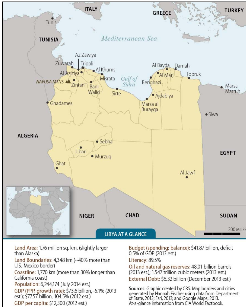
Figure 2. Libya: Map and Select Country Data

The revised transitional roadmap currently calls for an elected Constitutional Drafting Assembly (CDA) to produce a draft constitution for consideration by elected legislators and the Libyan public. Forty-eight out of 60 of the Assembly’s members were elected in February 2014 amid very low voter turnout; the remaining 12 seats were not filled due to boycotts and security disruptions, but are being filled as follow-on elections are held. As of May 14, Libya’s High National Election Commission reported that 55 members had been elected. According to the 2011 interim constitutional declaration, the CDA is scheduled to have four months from its first session to produce a draft constitution for consideration, a timeline which many outside observers viewed as ambitious and potentially problematic even prior to recent events. The CDA held an initial meeting on April 20, in Al Bayda, and is consulting with Libyans and international supporters.