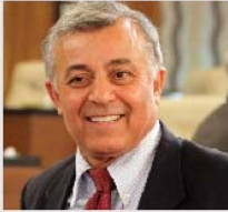
Figure I. Select Libyan and U.S. Figures